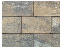
South Bay Blend