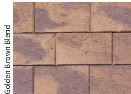
Golden Brown Blend