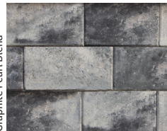
Graphite Pearl Blend*