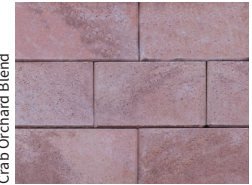
Crab Orchard Blend