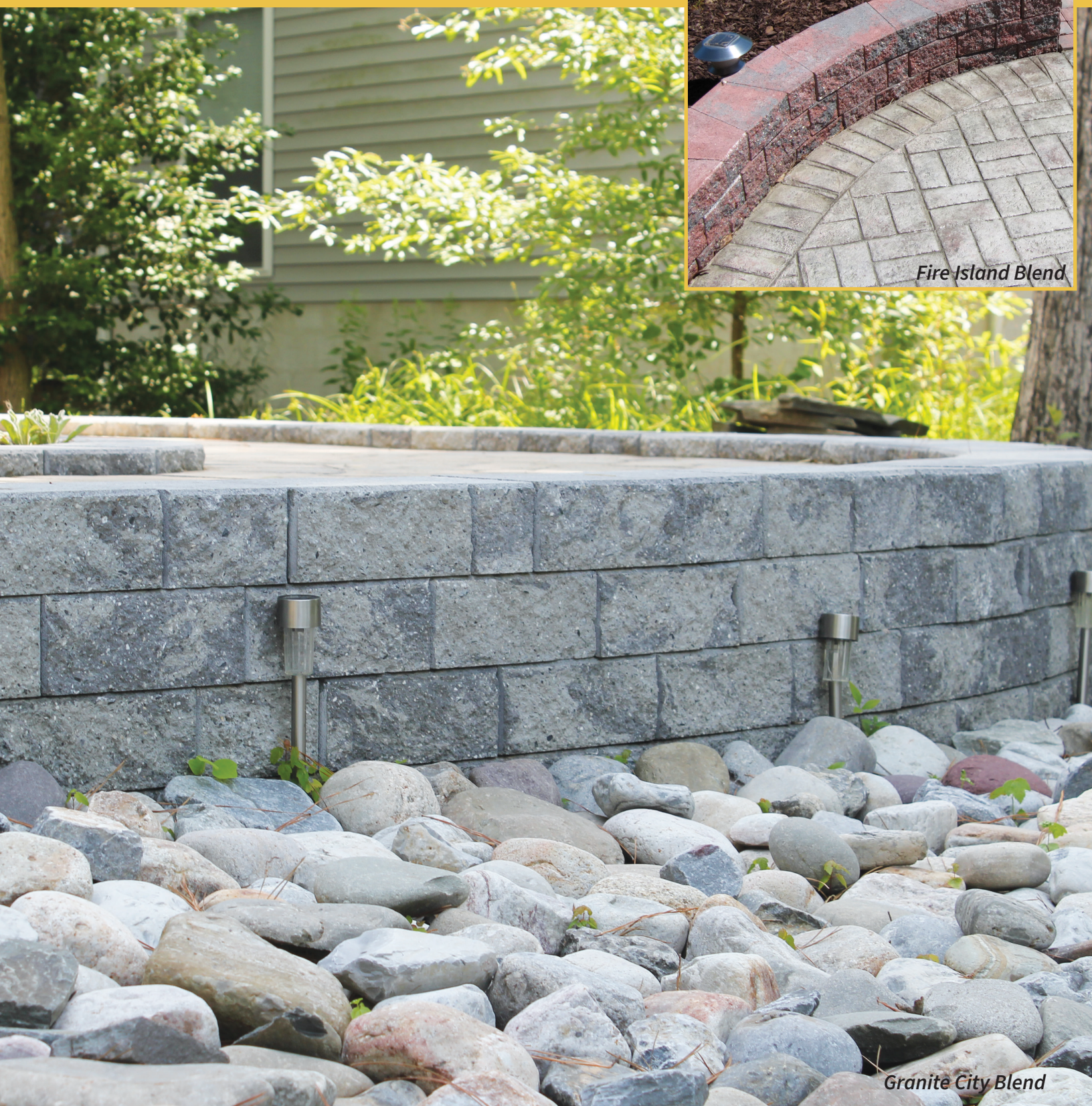
Fire Island Blend