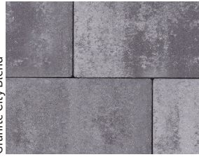
Granite City Blend