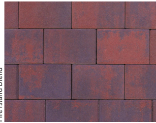
Fire Island Blend