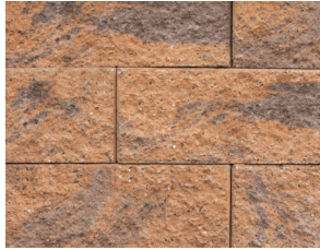
Golden Brown Blend