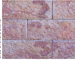
Crab Orchard Blend