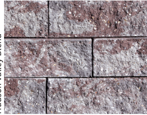
Hudson Valley Blend