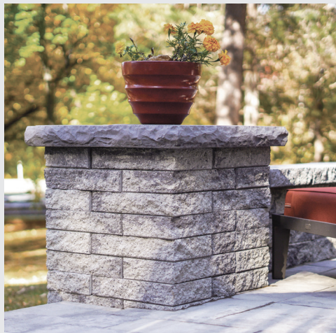
Granite City Blend