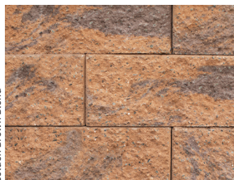
Golden Brown Blend