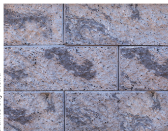
Granite City Blend