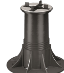
SE5-P covers heights: 6.75"-8.5"