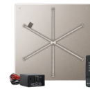
25" Square Drop-In TFS Gas with Remote *Must Order Gas Specific