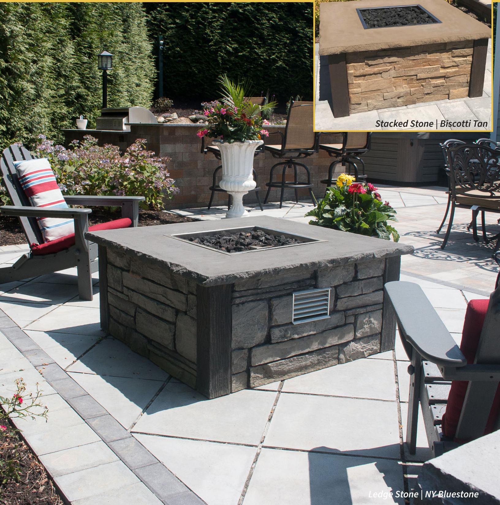
Stacked Stone | Biscotti Tan