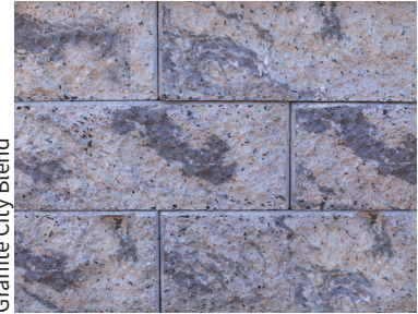
Granite City Blend