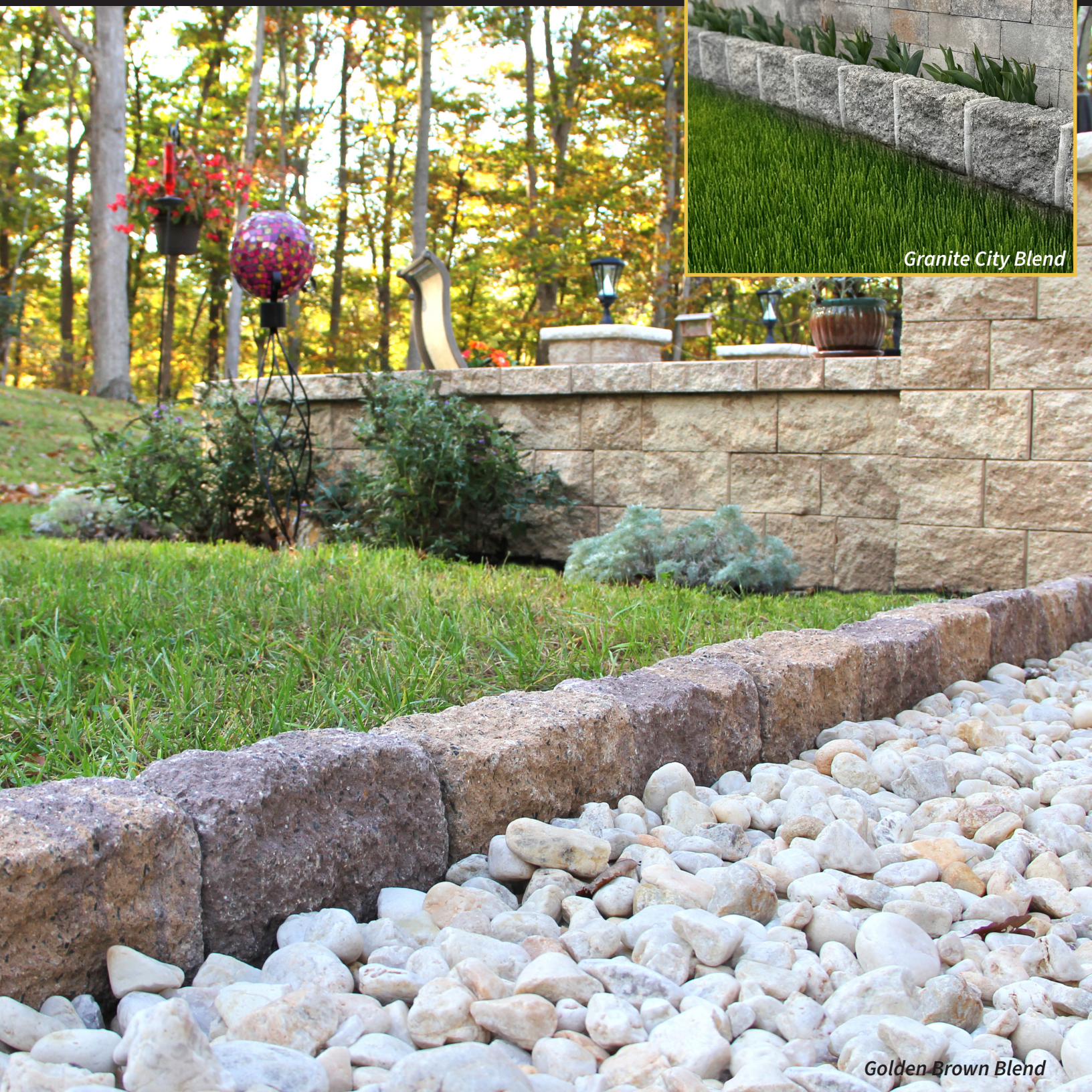
Granite City Blend