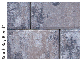
South Bay Blend*