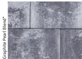
Graphite Pearl Blend*