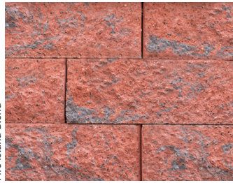
Fire Island Blend