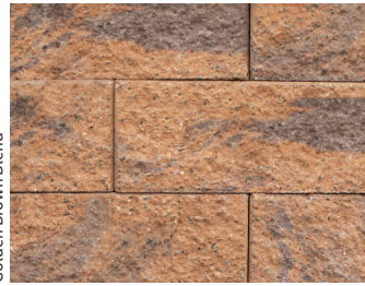
Golden Brown Blend