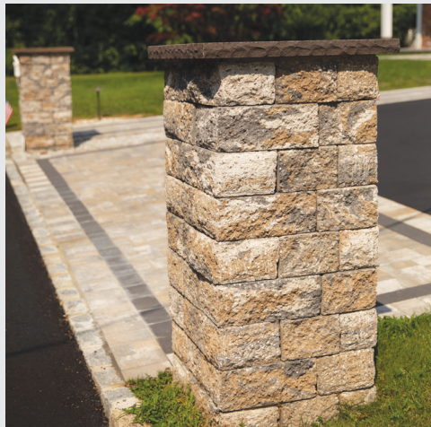
South Bay Blend

Corner blocks are used to build the pier. A cap provides the finishing touch as well as additional lighting possibilities.