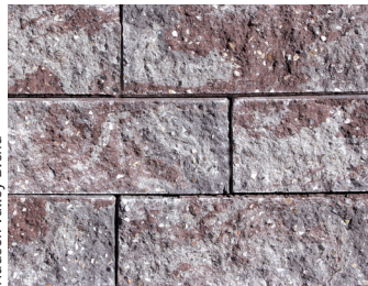
Hudson Valley Blend