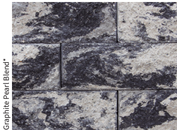
Graphite Pearl Blend*