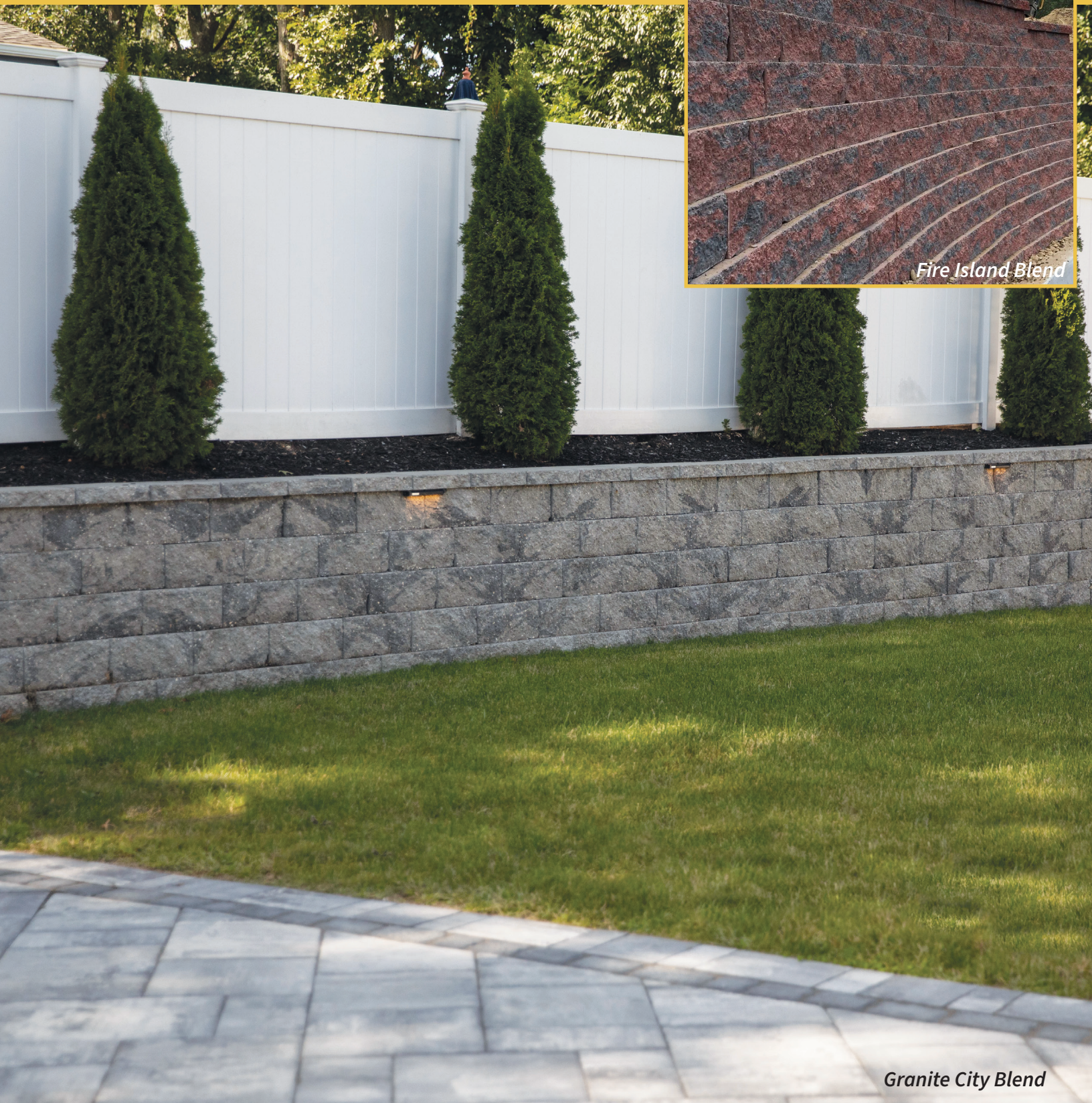
Fire Island Blend